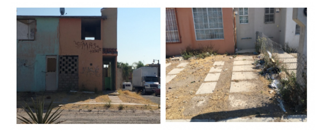
Figures 3 and 4. Entropies in the rationalist-progressive occupancy in La Azucena Source: Author's own elaboration. Fieldwork research, december 2016.

available information, the area with more population corresponds to the main roadways, in contrast with those located near Las Pintas canal, which are less inhabited areas (figures 3 and 4).